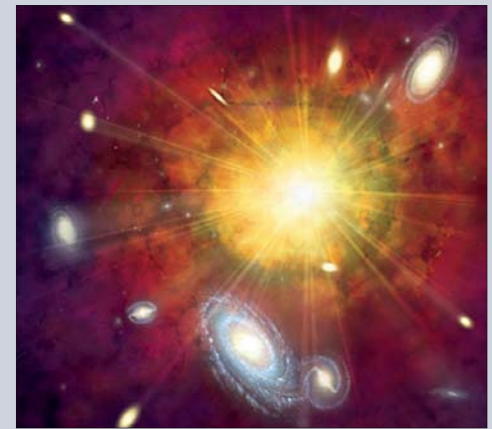
Figure 3: About 13.7 billion years ago all matter and energy in the universe was contained in a tiny singularity, smaller than any subatomic particle you can conceive of. This is the basis for non-locality

combine them with the laws of quantum physics on non-locality you can construct the following conclusions: