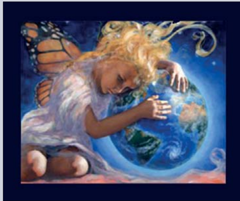
Figure 1: Love appears to be the most important psychological concept and force in any culture on the planet