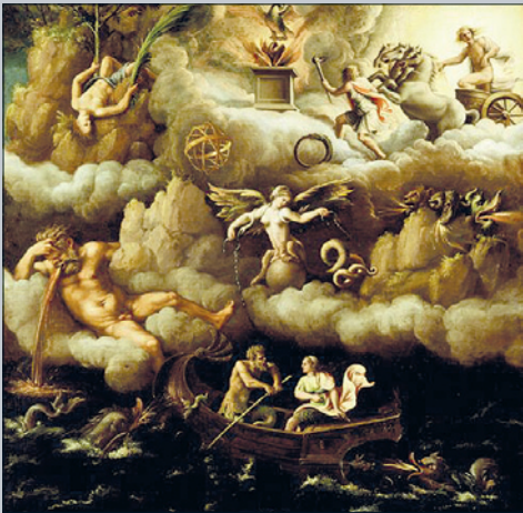
Figure 1: My Search For The Holy Grail of Immortality 1 —New technology has set the stage for “Directed Immortality” in humans.

Now studies at Duke University have shown that experiences in childhood, perhaps even later in life as well can affect the telomere length on your DNA—essentially nature’s impact on nature. In this study, researchers followed 1,100 British families with twins who were born in the 1990s. They took DNA samples from the children at 5 and 10 years of age. 9 Over the years, the researchers also conducted in-depth interviews with the twins’ mothers. Those children who experienced during their youth, some form of negative event, such as domestic violence, frequent bullying or physical maltreatment by an adult, had significantly more telomere loss than other children who did not have these experiences. Since shorter telomere length has been connected to poor survival rates and chronic disease, this does not look good for those children. It suggests that negative events foster the onset of chronic disease and a shorter lifespan, while happiness and fulfillment support a health and longevity.