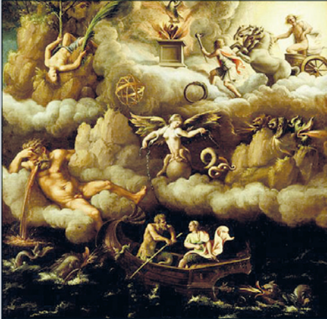
Figure 1: My Search For The Holy Grail of Immortality 1 —New technology has set the stage for “Directed Immortality” in humans.

Now studies at Duke University have shown that experiences in childhood, perhaps even later in life as well can affect the telomere length on your DNA—essentially nature’s impact on nature. In this study, researchers followed 1,100 British families with twins who were born in the 1990s. They took DNA samples from the children at 5 and 10 years of age. 9 Over the years, the researchers also conducted in-depth interviews with the twins’ mothers. Those children who experienced during their youth, some form of negative event, such as domestic violence, frequent bullying or physical maltreatment by an adult, had significantly more telomere loss than other children who did not have these experiences. Since shorter telomere length has been connected to poor survival rates and chronic disease, this does not look good for those children. It suggests that negative events foster the onset of chronic disease and a shorter lifespan, while happiness and fulfillment support a health and longevity.